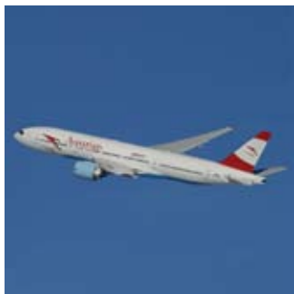
New rules for international flights