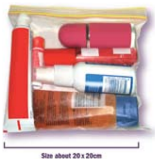
Pack items in a plastic resealable bag